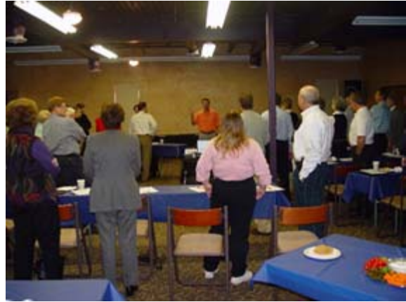
Members prepare for Wayne's control exercise.