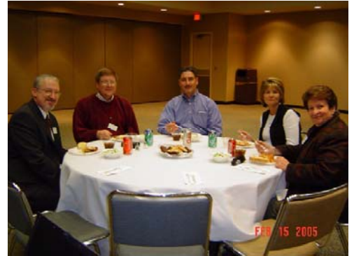
Chapter members enjoying lunch