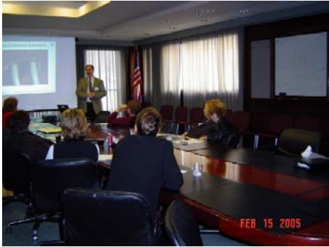
Learning about fire-stopping at the February meeting