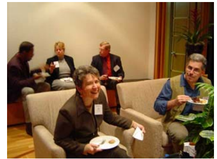
IFMA Tour & Reception at Conference